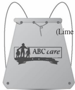
(Lime Green & Black)

ABC Care Water Bottle .... $10 Quantity _____