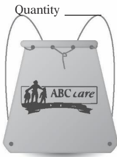
(Lime Green & Black)